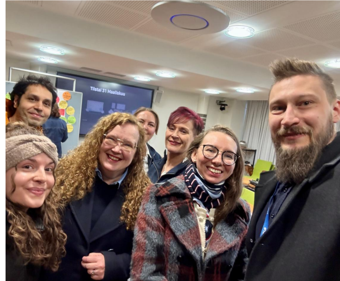
International workshop with the municipality of Muurame