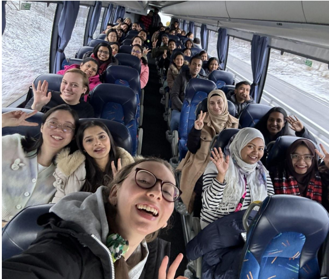
En route to Kinnula & Kannonkoski municipalities