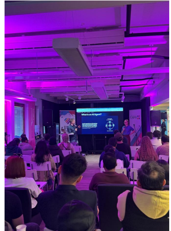
Talent Sprint Challenge at Digi & Game Center, Jyväskylä