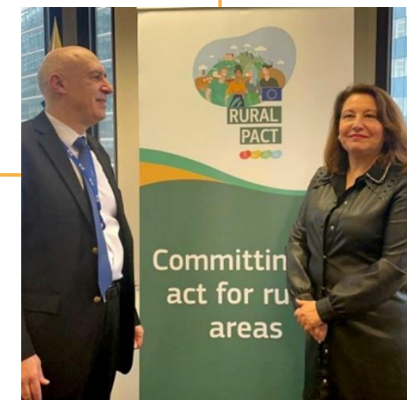
Commitment to the Rural Pact, Regional Government of Andalusia, 2024