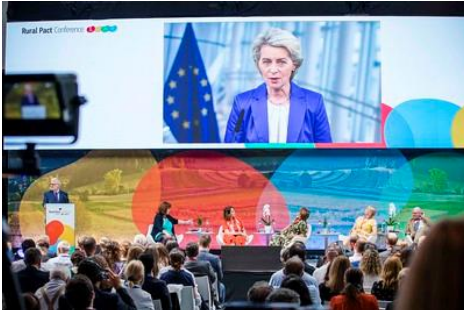
The 1st Rural Pact Conference, June 2022