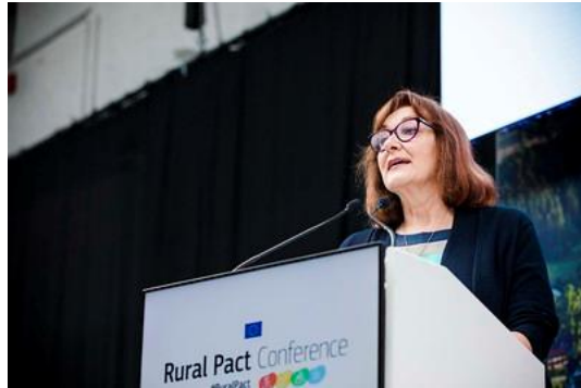
1st Rural Pact Conference, June 2022