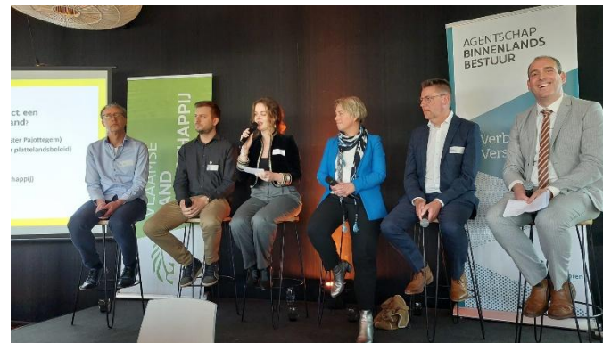
Launch of the Flemish Rural Pact, 2025