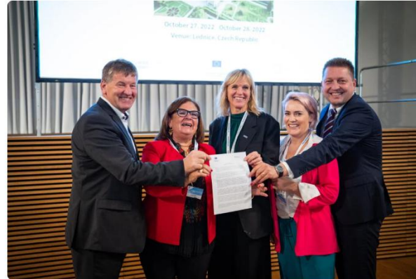
Launch of the Czech Rural Pact, 2022