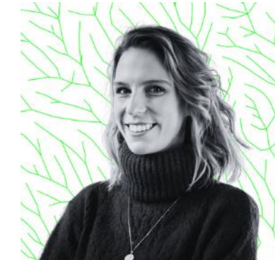
Charlotte Boby Communications